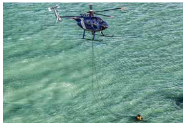
Police Air Unit, Hungary