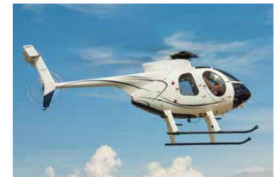
Bushveld Game Capture: Wildlife Management