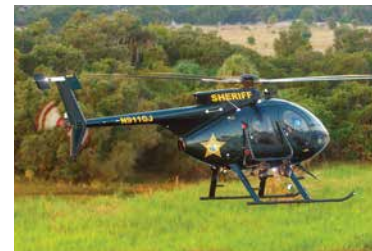
Polk County Police Department: Search & Rescue