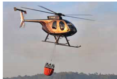
Canadian Dept. of Natural Resources: Fire Control