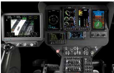
Glass Cockpit with Howell Instruments Engine Instruments Display & Garmin G500TXi MFD/PFD